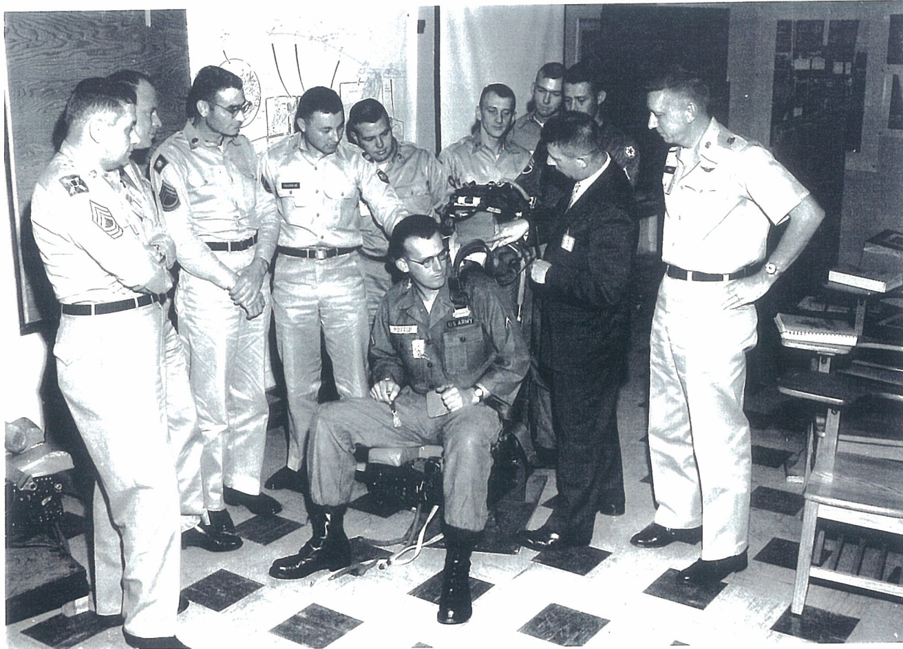
3/1960 EARLY CLASSES CONDUCTED AT GRUMMAN BETHPAGE