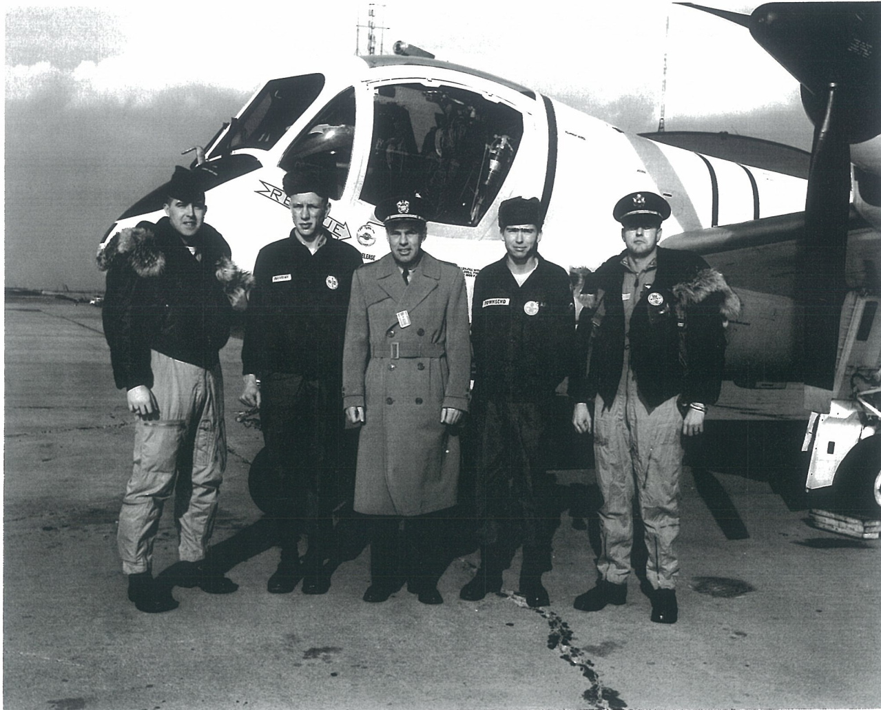
3/1960 ACCEPTANCE OF EARLY PRODUCTION MOHAWK